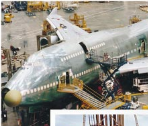
Micro-control RRC's are used in airplane maintenance operations and for remote control of drilling equipment in open pit mines.

A default system can be delivered with a maximum of 5 nodes. If more than 5 nodes or special data processing in the nodes is required, please contact Cavotec.