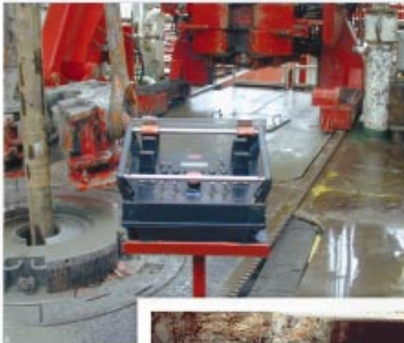
Many deck cranes are today controlled by radio remote controls. Above a Stena Supply Ship with two Hydralift cranes in Norway.

Micro-control RRC are used in mining and tunneling applications, both for normal and EEx environment. The intelligence of Micro-control equipment can in some cases replace a PLC on the machine.