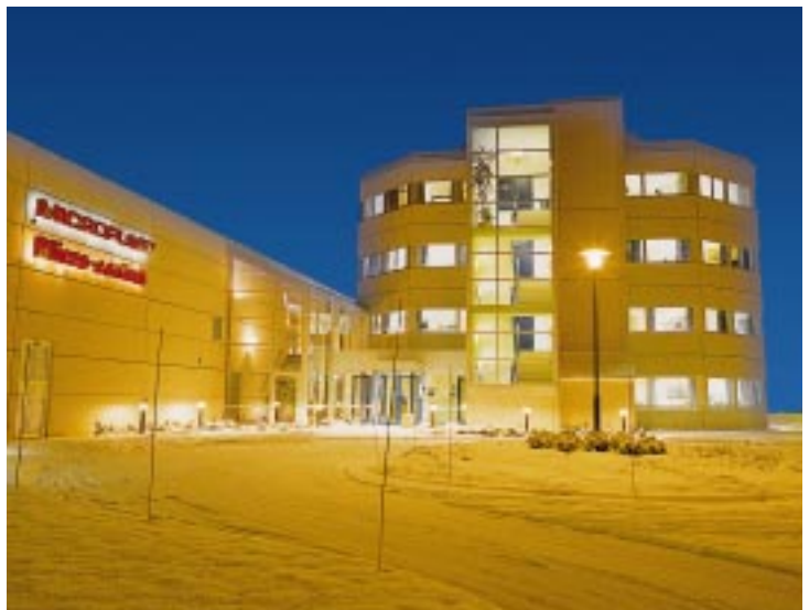
Former mother company of Micro-control, "Microplast" built its present factory in 1991 in Stjørdal, Norway. From this time Micro-control and Microplast have been co-located. Micro-control has the advantage of having its supplier of injection-moulded plastics "in House".